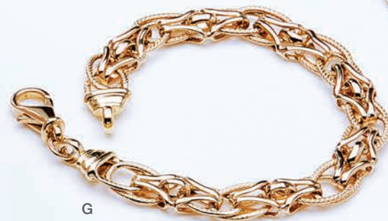
G 9ct yellow gold, 'Braid' bracelet. £915.00