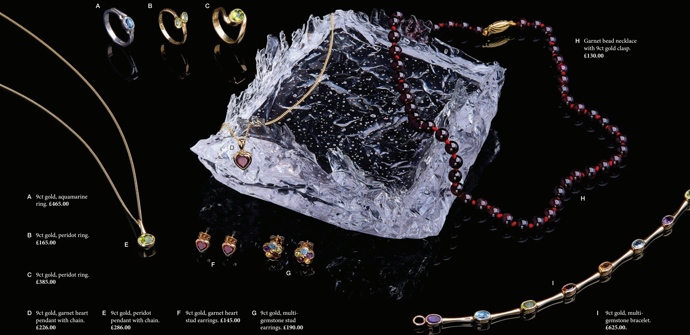
A 9ct gold, aquamarine ring. £465.00