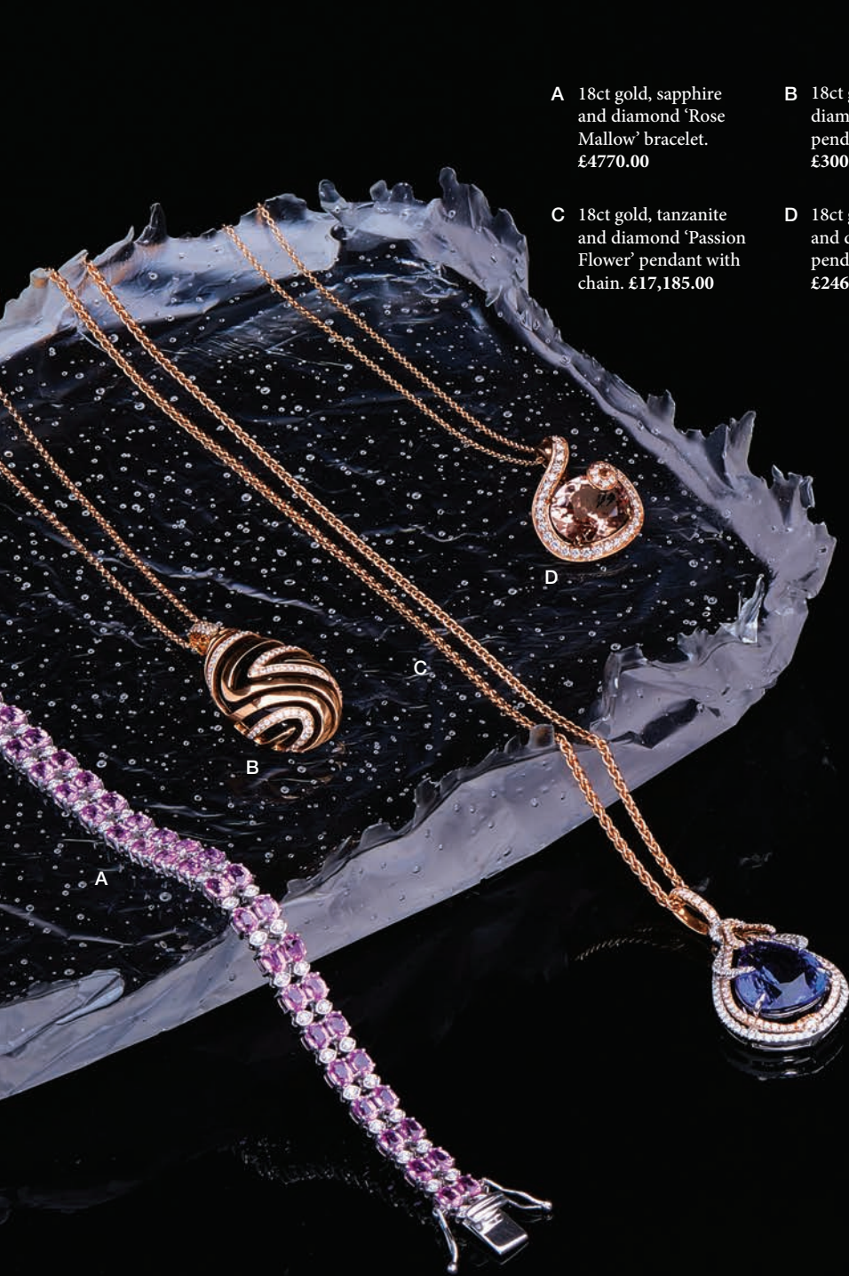
A 18ct gold, sapphire and diamond 'Rose Mallow' bracelet. £4770.00