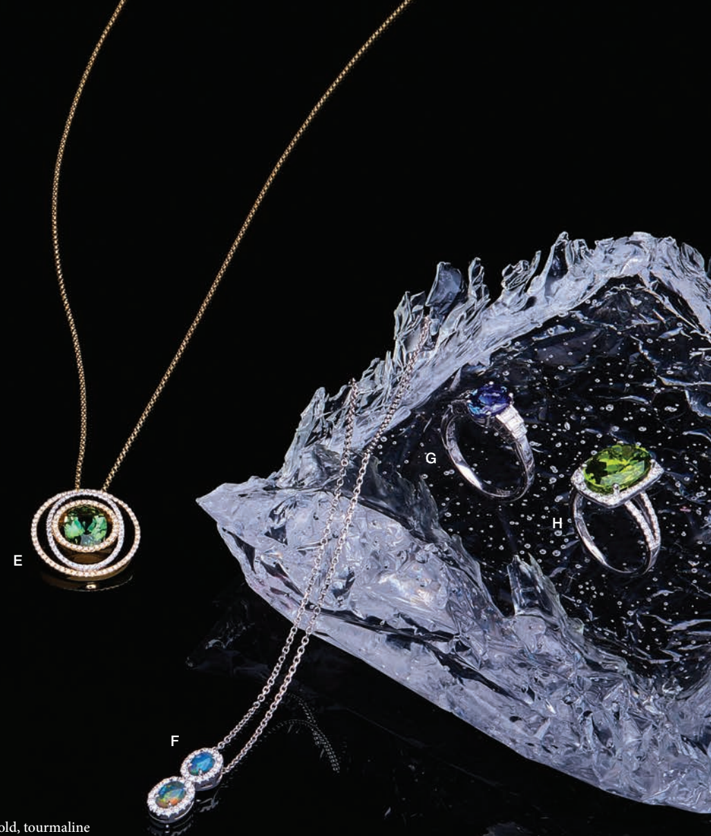
E 18ct gold, tourmaline and diamond 'Solar' pendant with chain. £3380.00