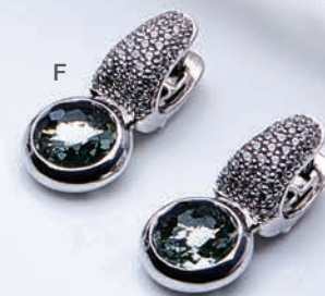
F Sterling silver, cubic zirconia and green stone set earrings. £179.00