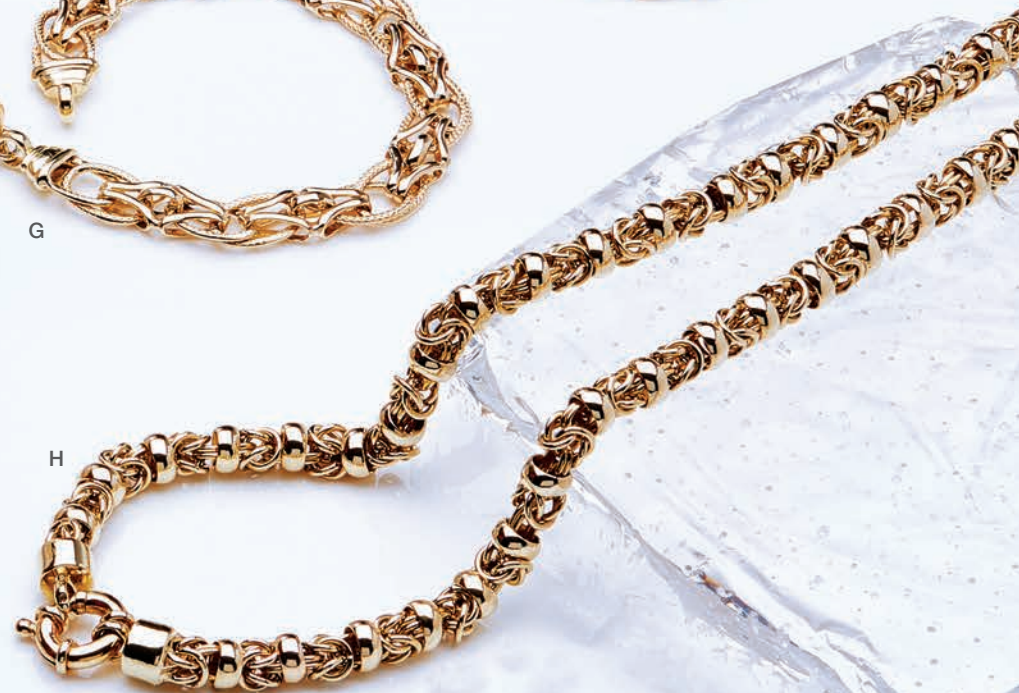
H 9ct yellow gold, 'Byzantine' necklace. £2680.00