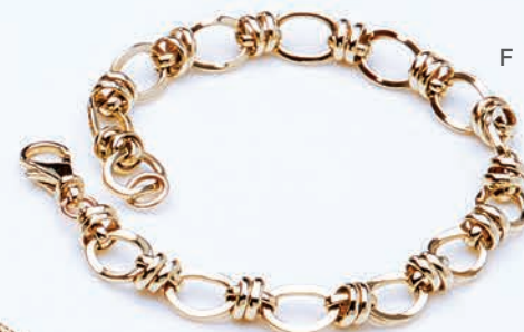
F 9ct yellow gold, 'Rondelle' bracelet. £740.00