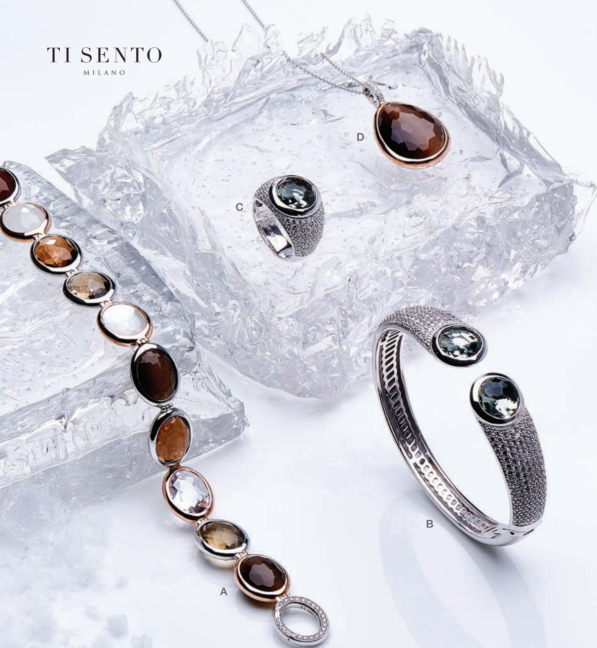
A Sterling silver, cubic zirconia and stone set bracelet. £349.00