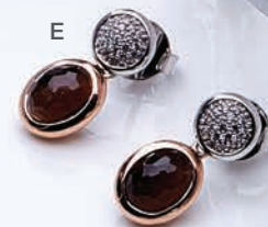
E Sterling silver, cubic zirconia and brown stone set earrings. £129.00