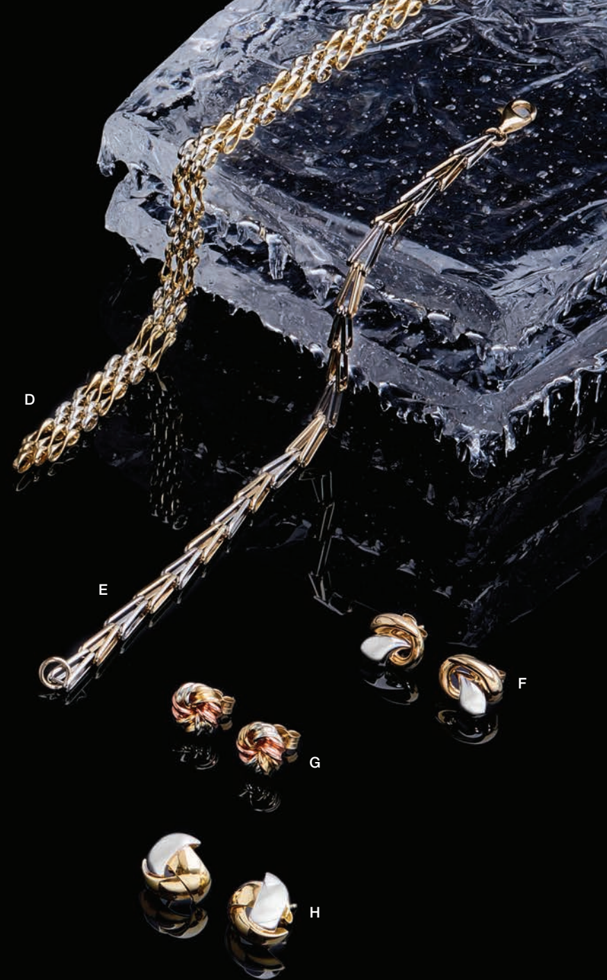
D 9ct yellow and white gold, 'Ribbon' bracelet. £750.00