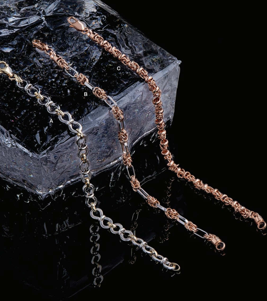
A 9ct white and yellow gold, 'Figure of Eight' bracelet. £515.00