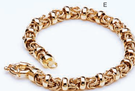
E 9ct yellow gold, 'Byzantine' bracelet. £1230.00