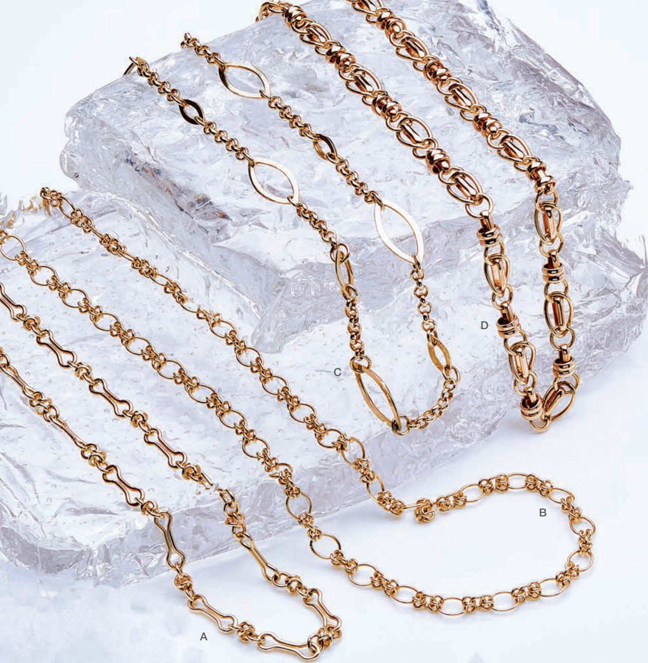
A 9ct yellow gold, 'Bow' necklace. £995.00